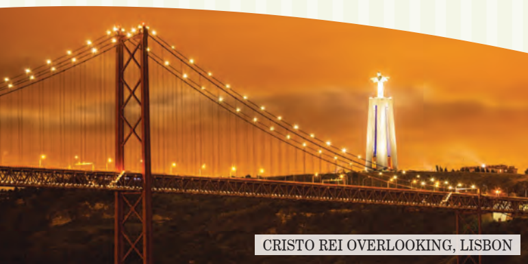
CRISTO REI OVERLOOKING, LISBON

Thursday, 25 th April | This morning we check-out from our rooms and go on our last half day optional excursion visiting the lovely Palmela Castle. The castle, whose stones hold historic memories dating to pre-history, sits high up on the Serra de Arrábida hills, offering exquisite panoramic views of the region and the Tagus and Sado rivers. We then return to the hotel and later make our way to Lisbon Airport for our Air Malta flight departing at 9.45pm and arriving in Malta at 1.45am (early Friday 26 th April).