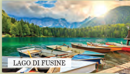
LAGO DI FUSINE

VISITING Bled, Bohinj, Mount Vogel, Velden, Pyramidenkogel, Terra Mystica, Ljubljana, Kranjska Gora and Lago di Fusine