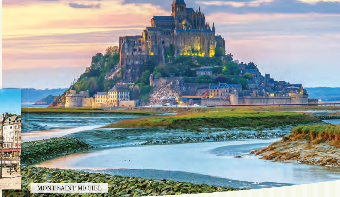
MONT SAINT MICHEL

Thursday, 18 th April | We meet at the airport at 4.30am for our Air Malta flight to Paris Charles De Gaulle airport departing at 6.25am. On arrival at 9.20am, our coach will pick us up to proceed to Paris for a free panoramic city tour, where we shall see amongst others Champs Elysees, Arc de Triomphe, Tour Eiffel, Place de la Concorde, L'Opera and Notre Dame Cathedral. Afterwards we will go to our 3 star Royal Hotel in Caen in Normandy.