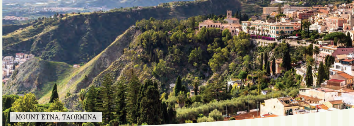
MOUNT ETNA, TAORMINA

VISITING Catania, Caltanissetta, Piazza Armerina, Enna, Cefalu, Sicilia Outlet Village, Mount Etna, Zafferana dell'Etna & Taormina