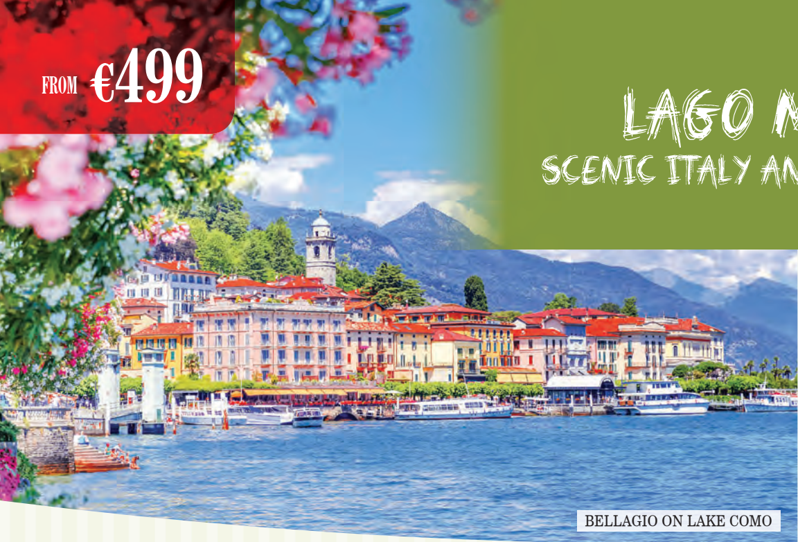
BELLAGIO ON LAKE COMO