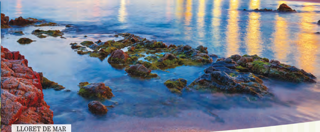
LLORET DE MAR

L-Erbgha, 17 ta' April | Niltaqghu l-ajruport ta' Malta f'nofsinhar għat-titjira diretta tar-Ryanair fl-02.05pm għal Girona. Mal-wasla tagħna transfer għal Lloret de Mar u sistemazzjoni tal-kmamar.