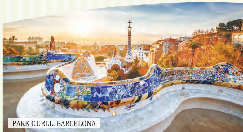
PARK GÜELL, BARCELONA

zjara, fost l-oħrajn, ngħaddu minn hdejn il-Kattidral majestuż ta' Santa Marija, mill-kwartieri fejn kienet tgħix il-komunità Lhudija. Wara nofsinhar naqbd triqitna għall-ajruport ta' Barcellona minn fejn bit-titjira diretta tal-Vueling fil-8.15pm nitilqu għal Malta fejn naslu fis-10.20pm.