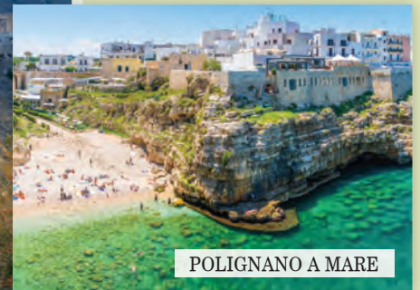
POLIGNANO A MARE

Wednesday, 5 th June | We meet at the airport at 9.30am for our Ryanair flight departing at 11.35am to Bari airport. We start our trip by visiting Bari St. Nicholas city, well known for its port and University. Visits to the Basilica of Saint Nicholas, the Bari Cathedral (dedicated to saint Sabinus of Canos) and Petruzzelli Theatre are a must. We can stroll the streets of Barivecchia (Old Bari) from Piazza Mercantile to Piazza Ferrarese. We then are transferred to our Trullo