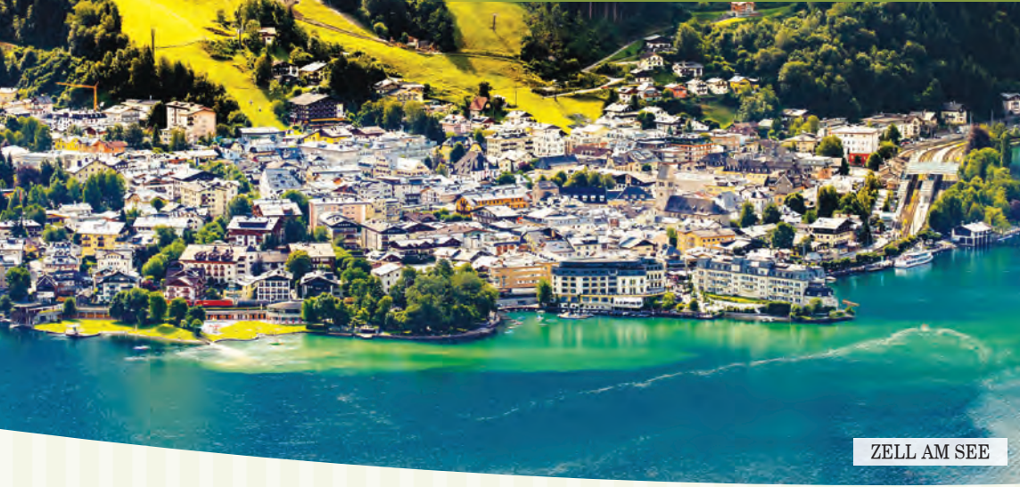
ZELL AM SEE